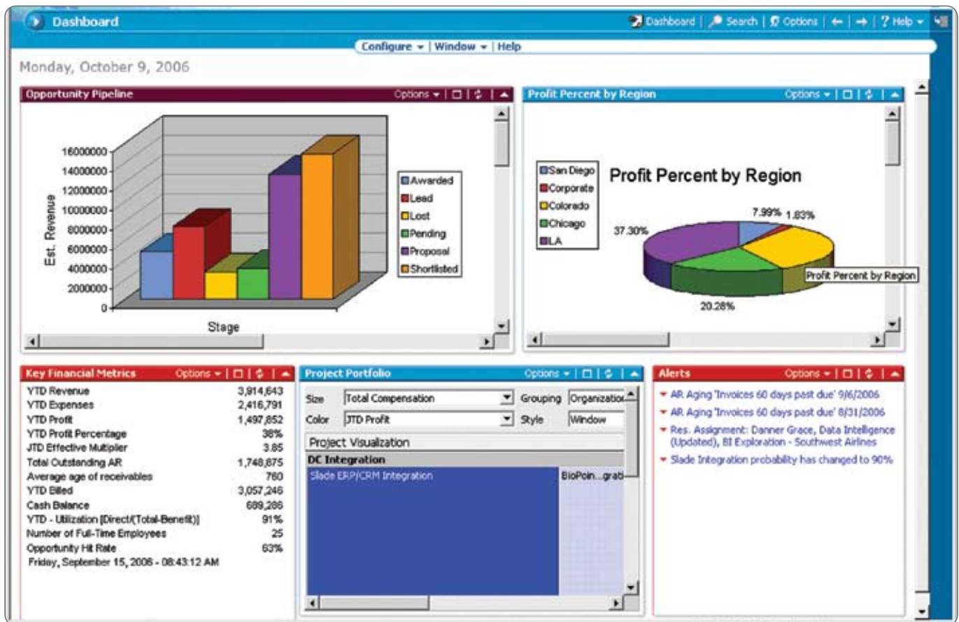
Figure 1: Deltek Vision Dashboard provides a customized view of critical information across projects and business processes.

Vision Dashboard — A standard feature of Deltek Vision’s Reports, the Dashboard combines information from different areas of Vision, allowing each user to configure a single web page that brings together all the information and tools that he or she relies on most links to key application areas, reports and records, important activities and events as well as workflow features and alerts.